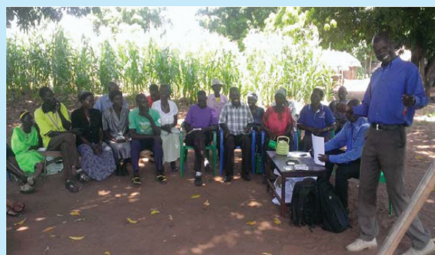
A community dialogue in Moyo District, Uganda, with health workers and community members. The meeting reflected upon RMNCAH indicators, allowed community members to share experiences and perceptions, and created a community action plan to address RMNCAH challenges.